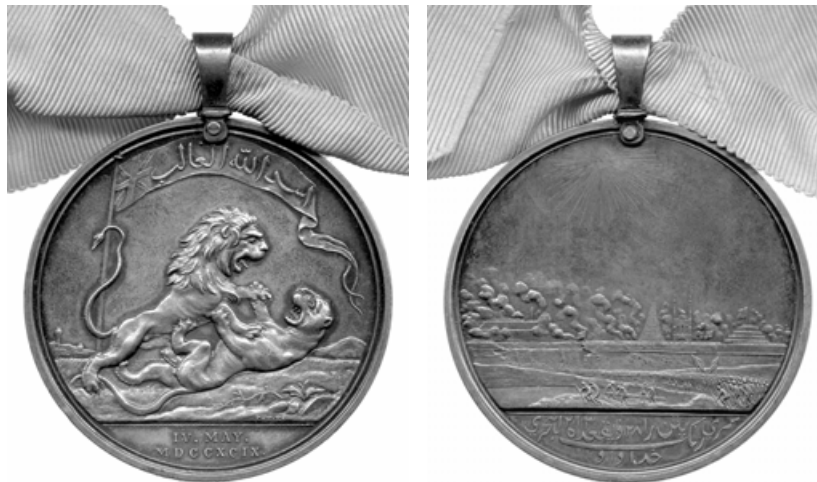
6 Seringapatam Medal, 1799 , an original English striking in silver, as awarded to captains and subalterns, 48 mm., with loop suspension, extremely fine £600-800